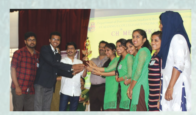
Chimera – 2019: Won Championship trophy