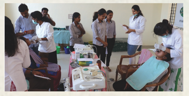
Students at Dental Camp 2019

The department, with the collaboration of Coorg Institute of Dental Sciences, Virajpet, organized a Dental Camp at Jnana Kaveri PG Centre on March 19, 2019. Staff and students of the centre were benefited by the camp.